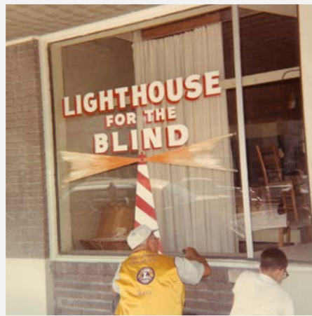
Original location on 34 N. Chadbourne

We have continued our mission since 1963, Creating Jobs and Changing Lives.